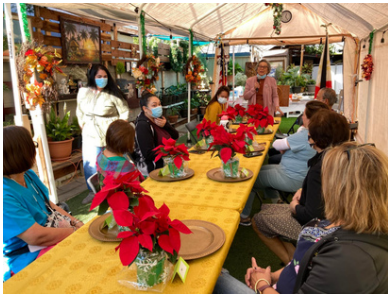
ERBF, AMG, and BHS

As November is the month of Thanksgiving, the Erasto R. Batongmalaque Foundation held a Thanksgiving party with the Argent Medical Group (A.M.G.) and the BHS Bayani Health Center. During the height of the pandemic, both the AMG and BHS gave their time and risked their lives providing healthcare services to people in need. However, the ERB Foundation did not relax either. We still held our Food Bank delivery to low-income households, which meant more since grocery shopping was limited. The Achievers group also held their thanksgiving party after a year of quarantine.