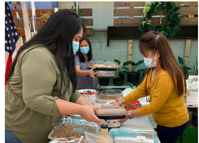
Food for Thanksgiving